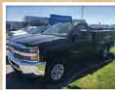
2017 CHEVY SILVERADO 3500HD 4x4 READING UTILITY BODY Stk# 17C517