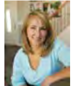
Danielle Zielinski Photographer