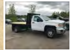
2016 GMC SIERRA 3500HD 4x4 STAKE BED Stk# 16G629

Call Spurr Chevrolet Today! 585-391-6524