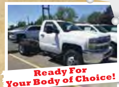
2017 CHEVY SILVERADO 3500HD 4x4 CHASSIS Stk# 17C621